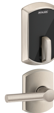
BE467F Schlage Control™ Smart Deadbolt Lock with Greenwich trim in Satin Nickel with Broadway Lever