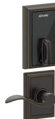
BE467F Schlage Control™ Smart Deadbolt Lock with Addison trim in Aged Bronze with Accent lever