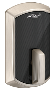
BE467F Schlage Control™ Smart Deadbolt with Greenwich trim in Satin Nickel