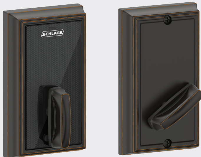
Schlage Control™ Smart Deadbolt with Addison trim in Aged Bronze