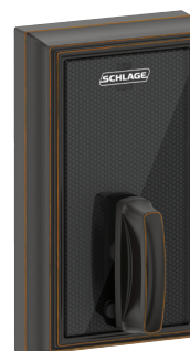
BE467F Schlage Control™ Smart Deadbolt with Addison trim in Aged Bronze