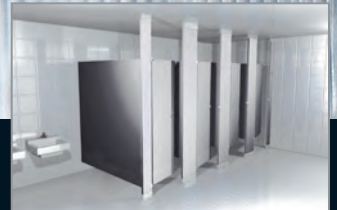
FLOOR TO CEILING