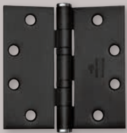
Five Knuckle Hinge, Button Tips

Shown - Satin nickel hinge Satin nickel tips