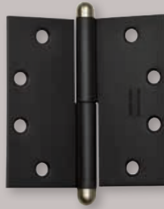
Two Knuckle Hinge, Round Tips

Shown - Satin chrome hinge Bright chrome tips