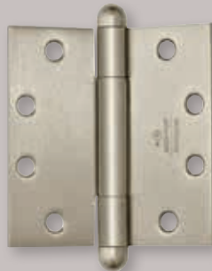
Three Knuckle Hinge, Round Tips

Shown - Bright chrome hinge Black powder coat tips