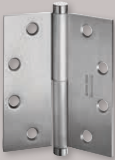
Two Knuckle Hinge, Flat Tips

The McKinney split finish offering allows you to customize your hinge to complement any building interior.