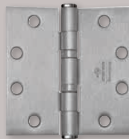
Five Knuckle Hinge, Button Tips

Shown - Black powder coat hinge Satin chrome tips