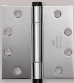
Three Knuckle Hinge, Flat Tips

Shown - Black powder coat hinge Satin nickel tips