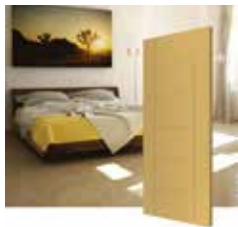
Page 5 Painted Hamel 6 Panel Equal with 2 Vertical Panels