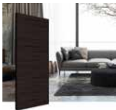
Page 8 Rift Cut Oak Horizontal Grain