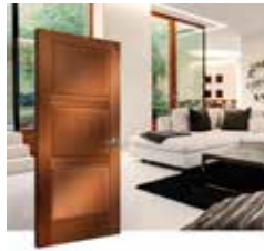
Page 2 Stained Hickory 3 Panel Equal Raised