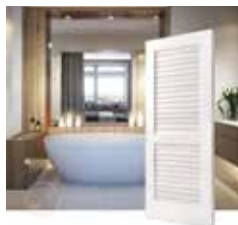
Page 13 Painted Wood Plantation Louver over Louver