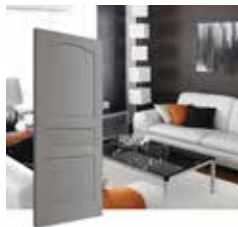
Page 6 Painted 3 Panel Arch Top Woodgrain