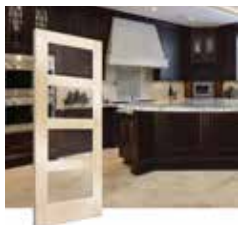
Page 12 White Oak 4 Panel with Flemish Glass