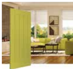
Page 10 Painted Saddlebrook 1 Panel V-Groove Plank