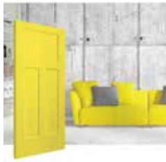
Cover Page Painted Winslow 3 Panel