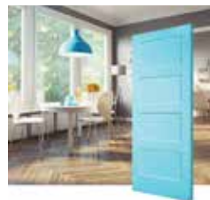
Page 11 Painted 4 Panel Equal