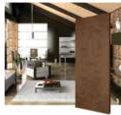
Page 7 Stained Birch Flush Panel