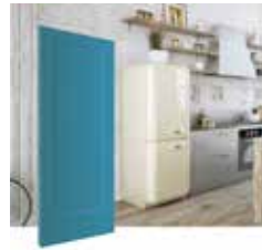
Page 4 Painted Lincoln Park 1 Panel Equal