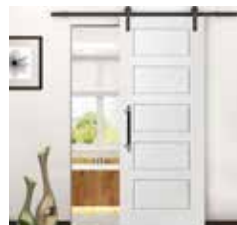
Page 14 Riverside 5 Panel Equal with Acme Barn Track

To download our full brochure, please visit: www.madero.ca