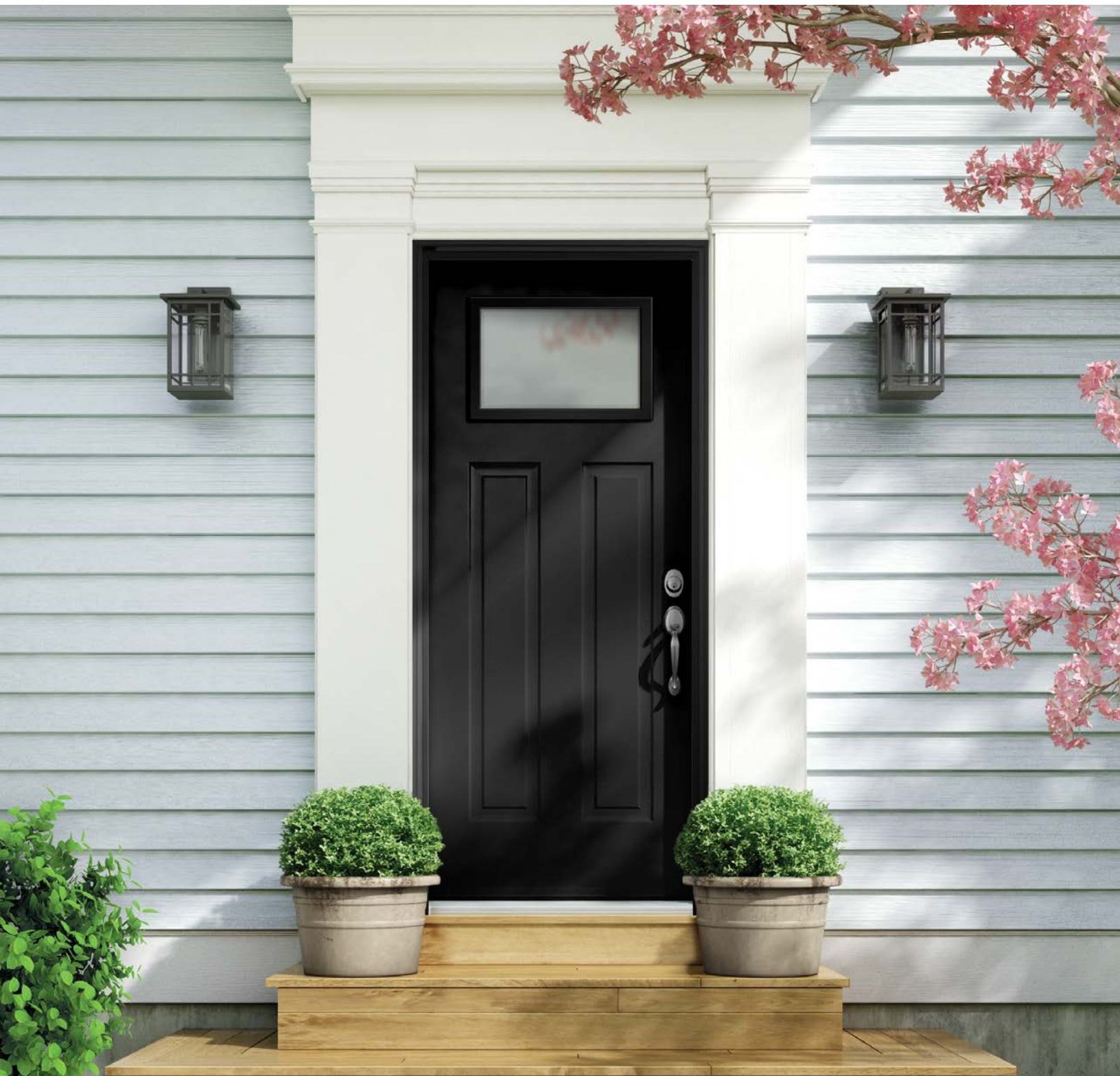
Black Dakota Victoria Shaker Door* with Clear Glass and Schlage Plymouth Handleset in Satin Nickel†. Also available with Bistro Glass.