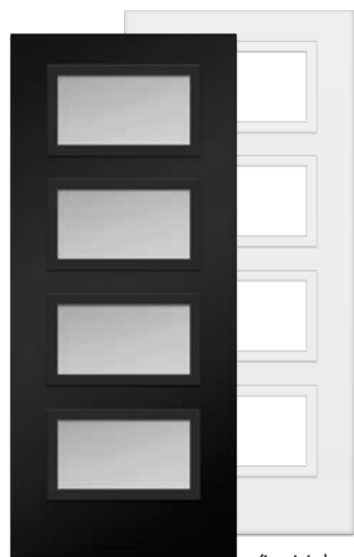
4 Lite with Clear or Frosted Glass

Black exterior, white interior. Madero's new Black & White Designer Entry Series features a steel door with factory painted black exterior and white interior, paired with a black aluminum clad frame and slimline aluminum brickmould.