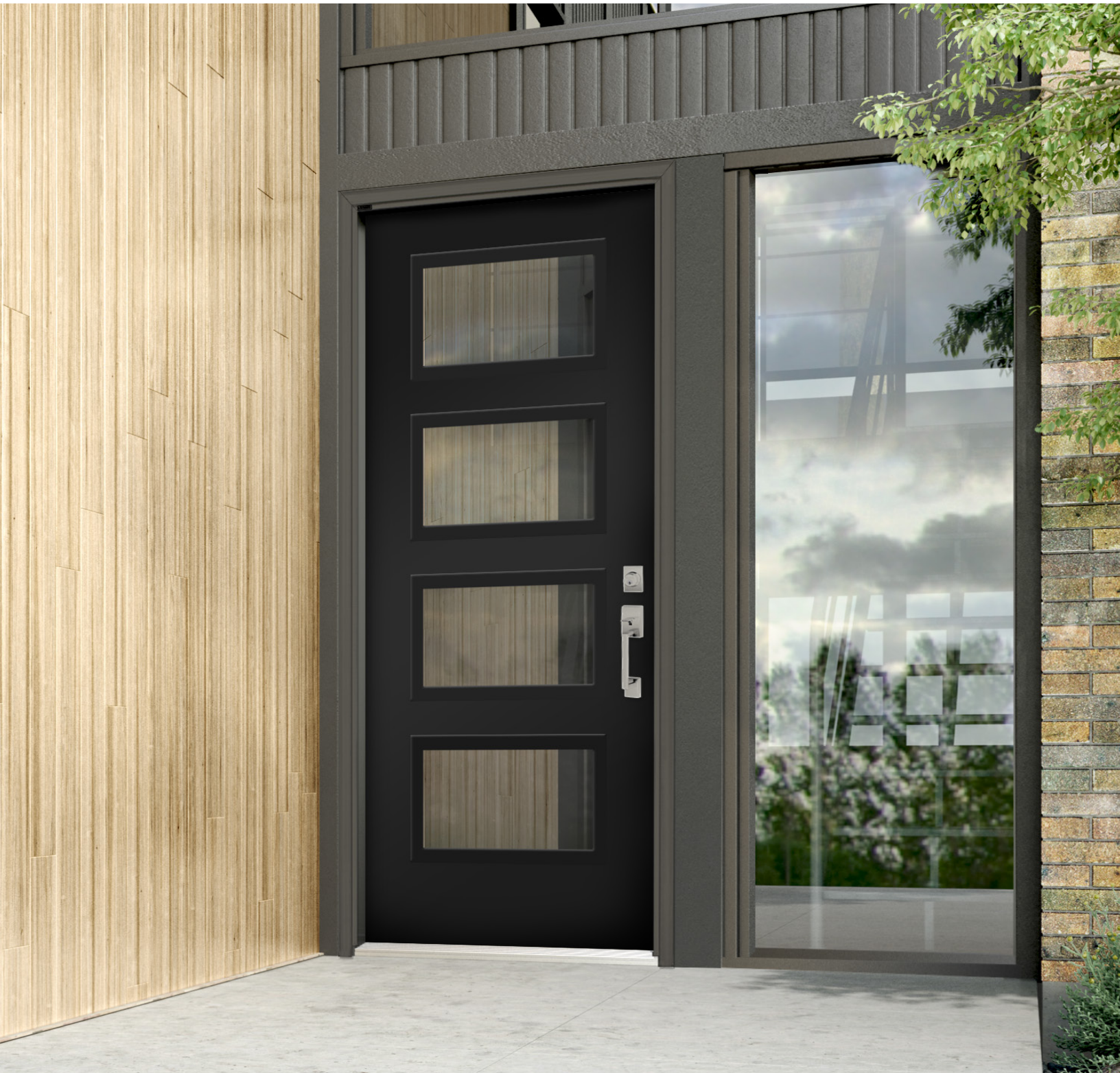
Black Basic 4 Lite Door* with Clear Glass and Schlage Century Handleset in Satin Nickel 1 . Also available with Frosted Glass.