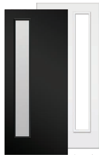
Narrow Lite with Clear or Frosted Glass

* Madero Black & White Designer Entry doors are supplied with a factory black exterior and white interior. † Door handles and deadbolt hardware not included.