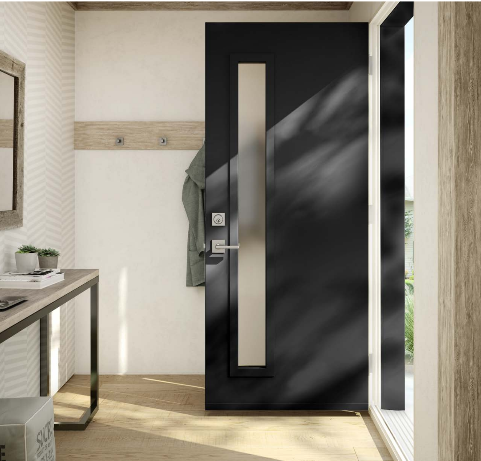
Black Basic Narrow Lite Door* with Frosted Glass, Schlage Latitude Lever and Deadbolt in Satin Nickel†. Also available with Clear Glass.