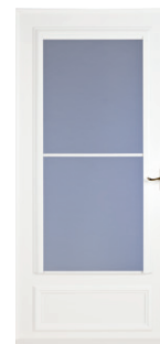
Model Shown: 830-80 Brass