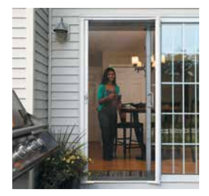
7723 Sliding Door Sizes: Width: 32" to 36" Height: 80"