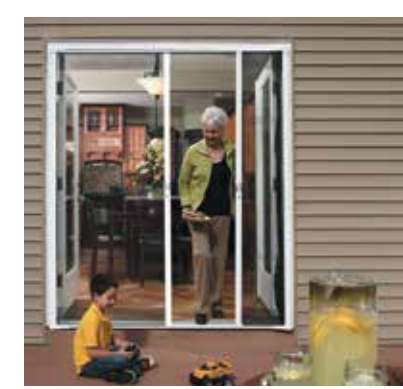
7722 Double Door Sizes: Width: 68" to 72" Height: 80", 96"