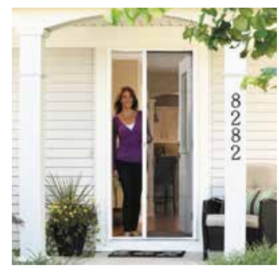
7721 Single Door Sizes: Width: 32" to 36" Height: 80", 96"