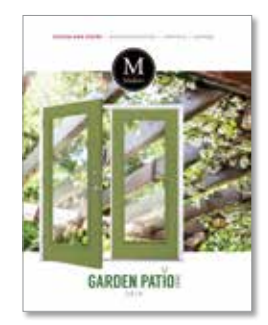
Garden Patio Door Series